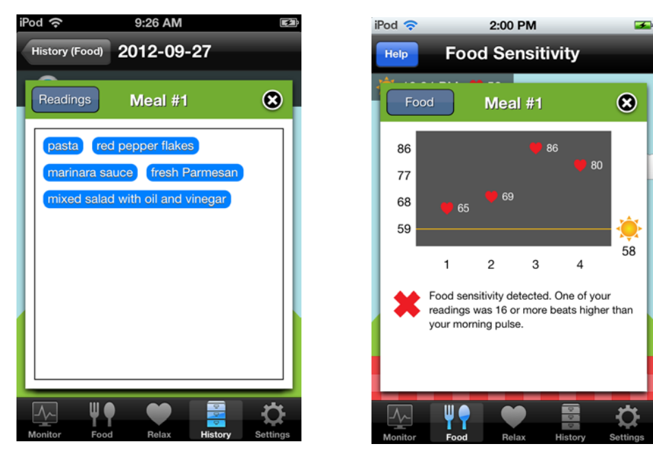
© 2011 SweetWater Health LLC. All Rights Reserved.

As you can see in the charts below, there was a significant increase in her heart rate after eating the meal. Because she ate several items, she could be sensitive to something else, with the cheese, marinara sauce and red pepper as the likely candidates.