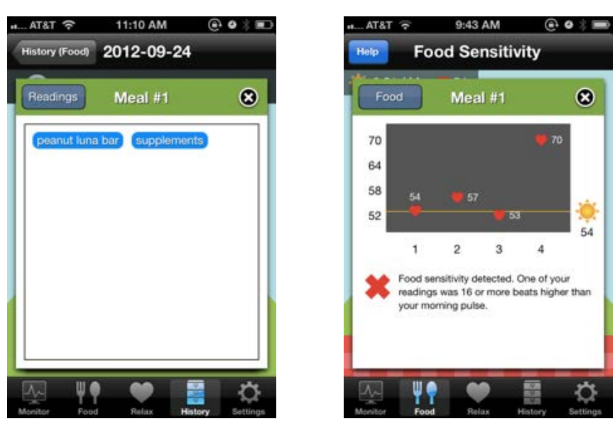
© 2011 SweetWater Health LLC. All Rights Reserved.

As you can see in the charts below, there was a significant increase in her heart rate after eating the Luna bar. This, along with the sluggish feeling, indicates that it is very likely that she has sensitivity one or more ingredients in the Luna bar.